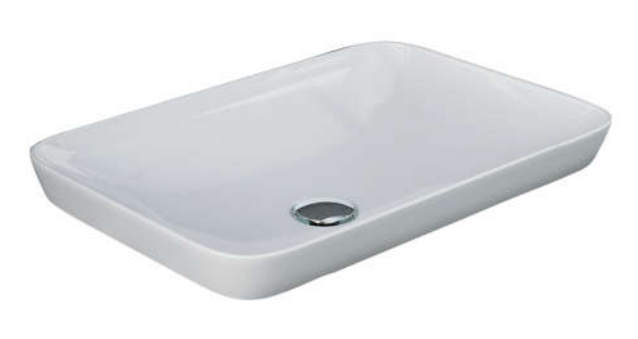
Drain not included